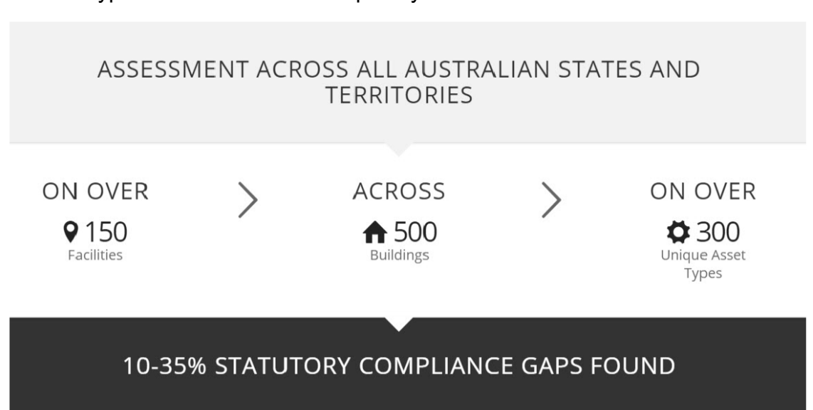
Figure 1 Case Study

Between 2015 to 2017, we performed statutory compliance assessments for maintenance programmes across all Australian States and Territories. These assessments covered over 150 facilities across 500 plus buildings, and over 300 unique asset types. It identified compliance gaps from 10% to 35% based on asset type and maintenance frequency.